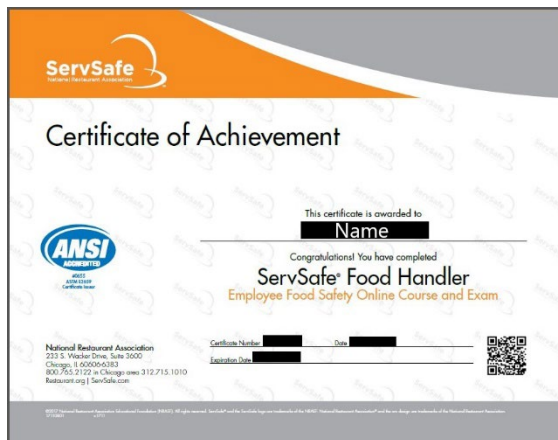
ServSafe Food Handler Certificate