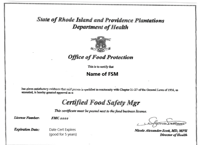
Food Safety Manager License