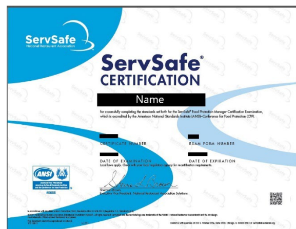
ServSafe Food Safety Manager Certificate