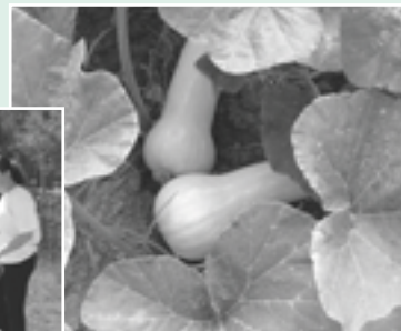
CELS is dedicated to helping those in need by providing valuable produce.