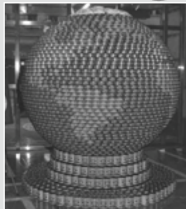
One Can Makes a Difference!